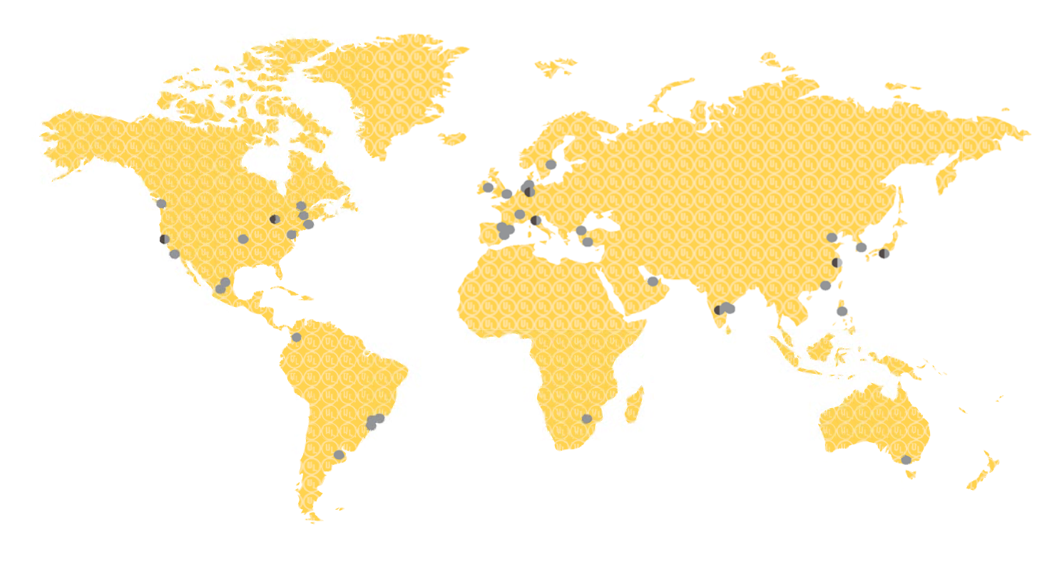
Inverter & PV Testing Laboratories Key Locations